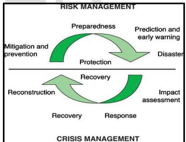
Figure 1 DRM Cycle (NDRMF Literature)

Disaster risk management is mostly designed as a cycle [24] with four stages: preparedness, emergency response, recovery (short term)/reconstruction (long term), and mitigation, as sequential activities; each of which is being addressed in a given scenario. An enhanced concept divides the process to distinguish between risk management in pre-disaster and crises management in post-disaster scenarios.