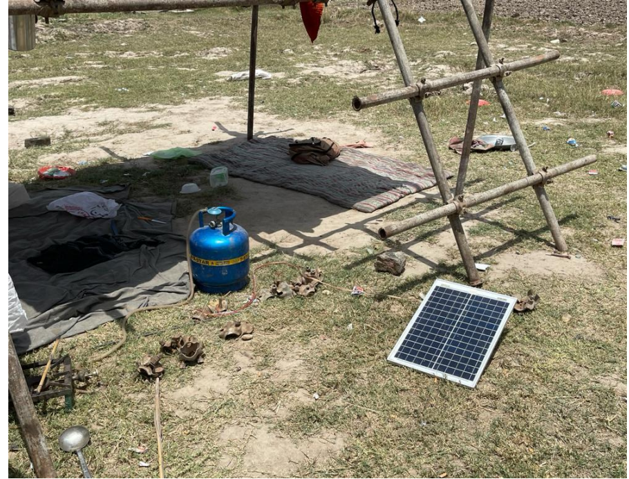
Figure 15: LPG Cylinders and Solar Panels Being Used on Sub-project Sites by Labors