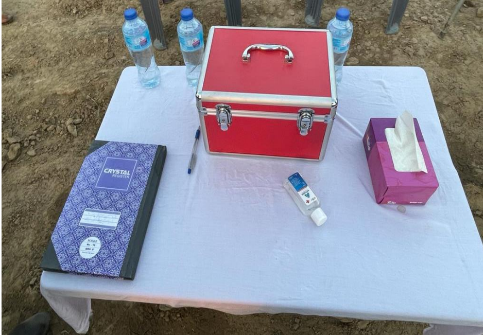
Figure 8: First Box and Grievance Redressal Register at Narowal Sites