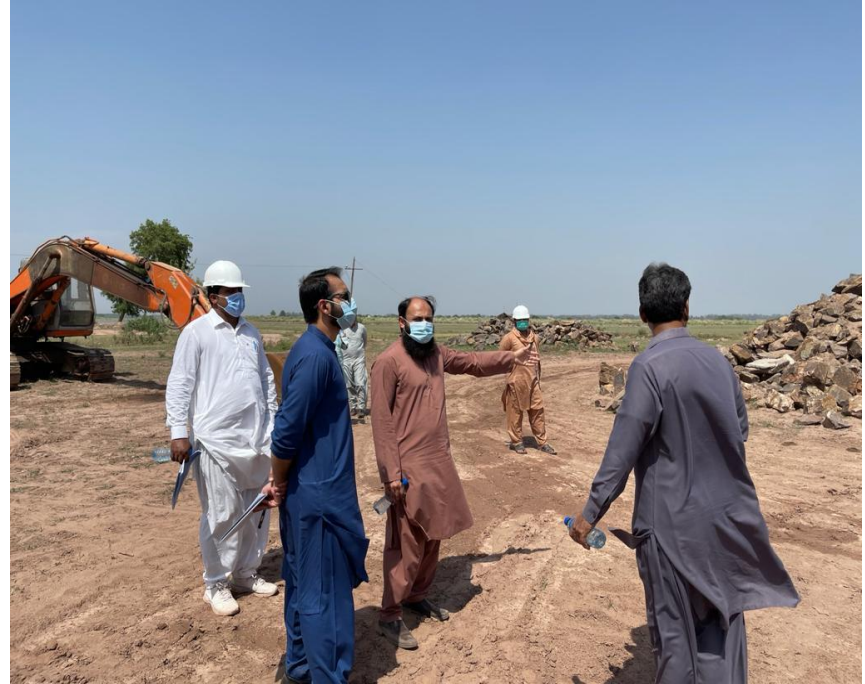
Figure 5: Consultation with Project Team at Hajipur Gujran Flood Protection Bund Site