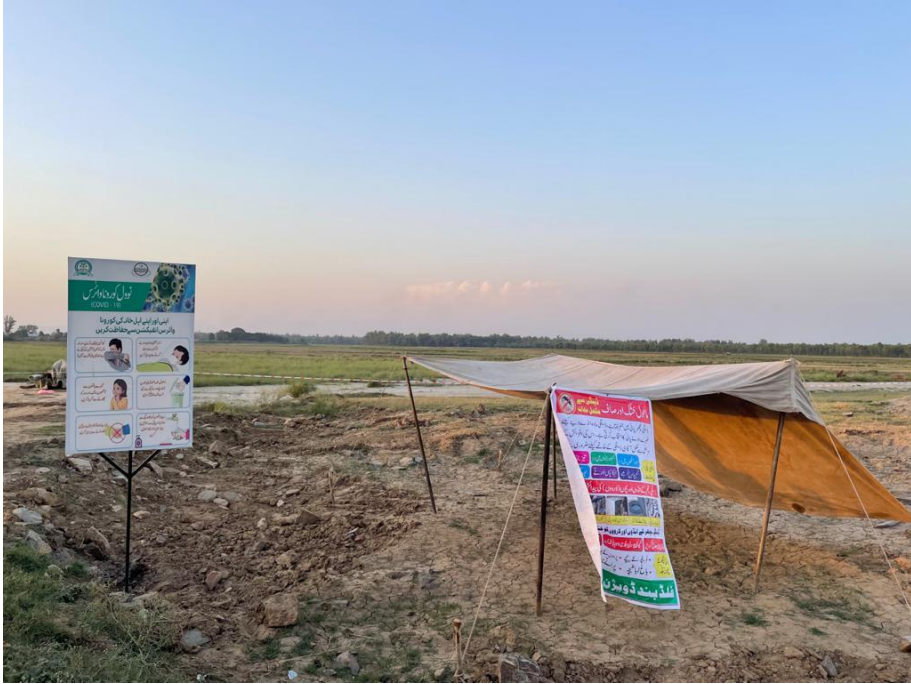
Figure 6: Covid-19 SOPs Displayed on Jalala Flood Protection Bund Site