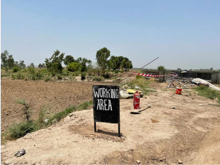
Figure 14: Signage of Working Area Erected on Sub-project Sites