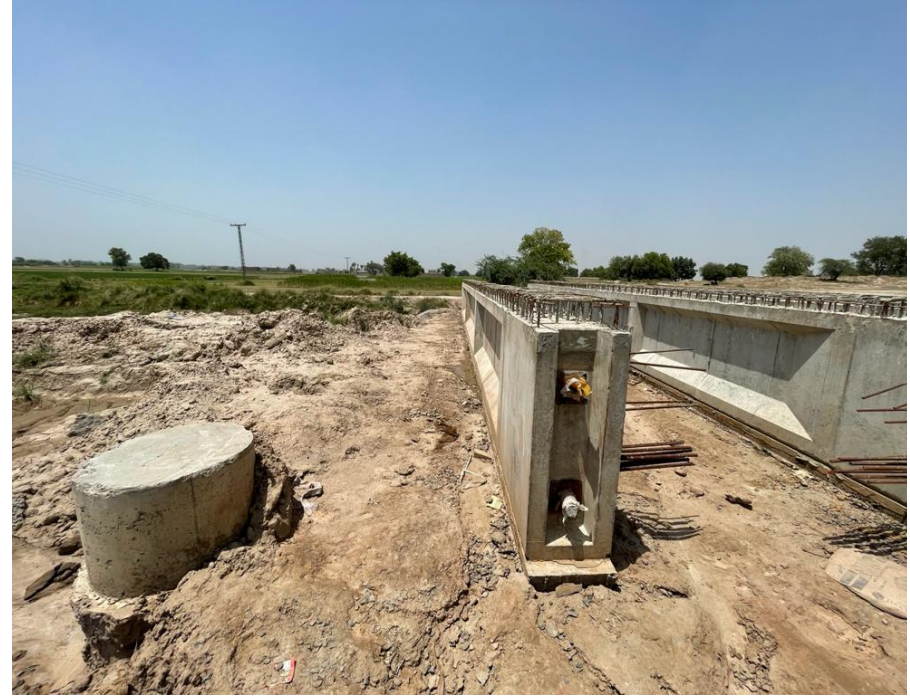
Figure 17: Piling and Construction of Bridges on Sub-project Sites