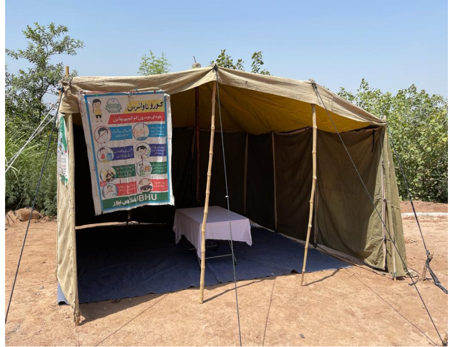
Figure 7: Covid-19 SOPs Displayed on Hajipur Gujran Flood Protection Bund Site