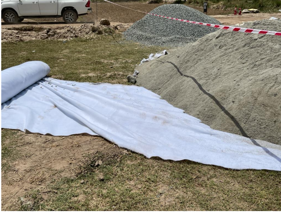
Figure 12: Materials Being Stockpiled on Sheets at Sub-project Sites