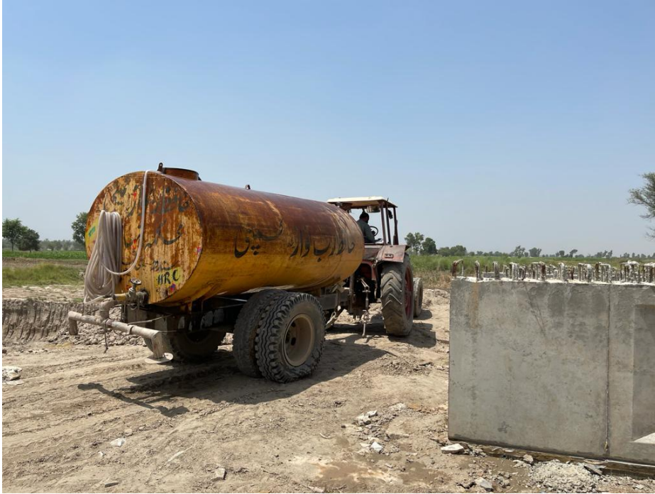
Figure 16: Water Sprinkling Tankers in Place for Daily Water Sprinkling