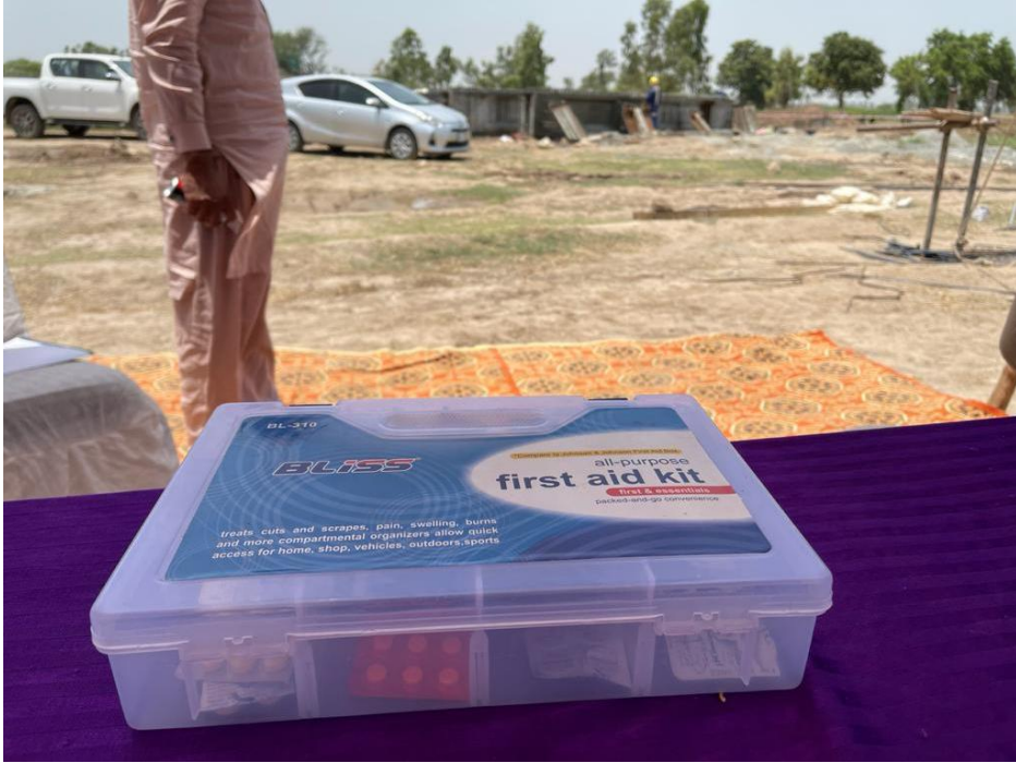
Figure 10: First Aid Box at Sheikhpura Sites