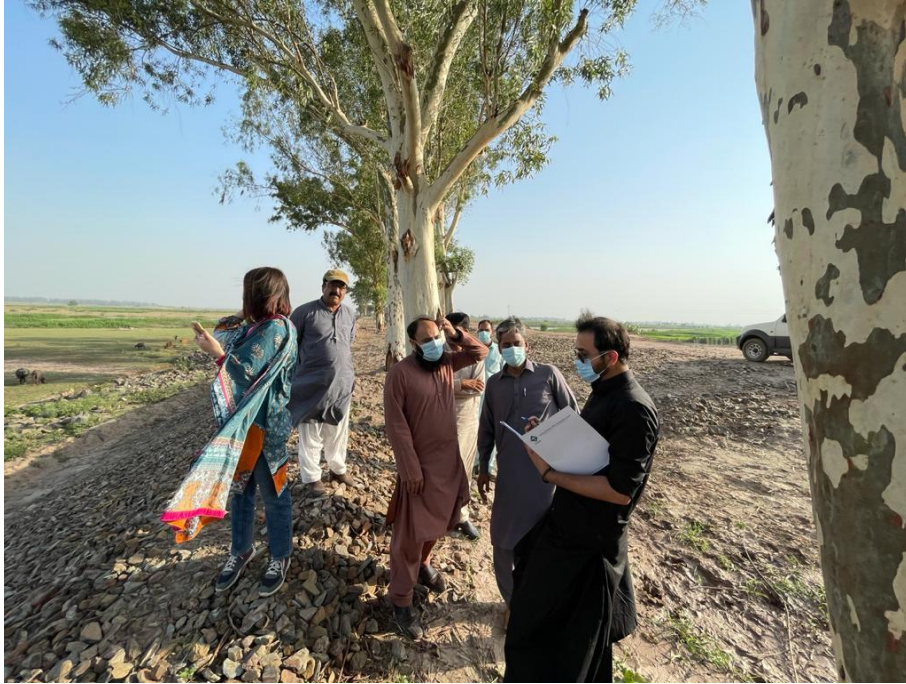
Figure 4: Consultation with Project Team at Hajipur Gujran Flood Protection Bund Site