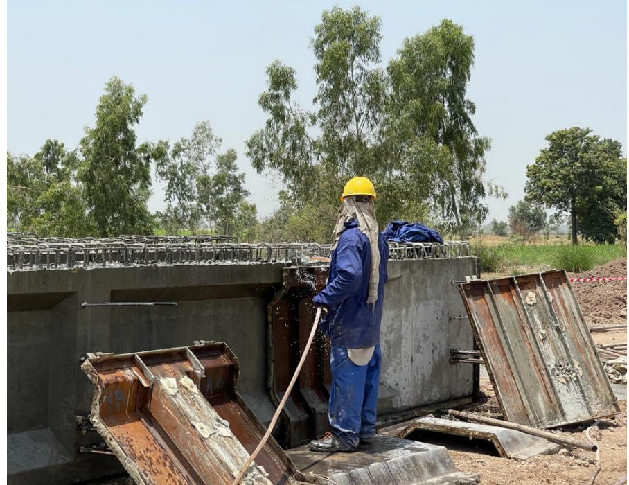
Figure 11: PPEs being used at Sub-project Sites