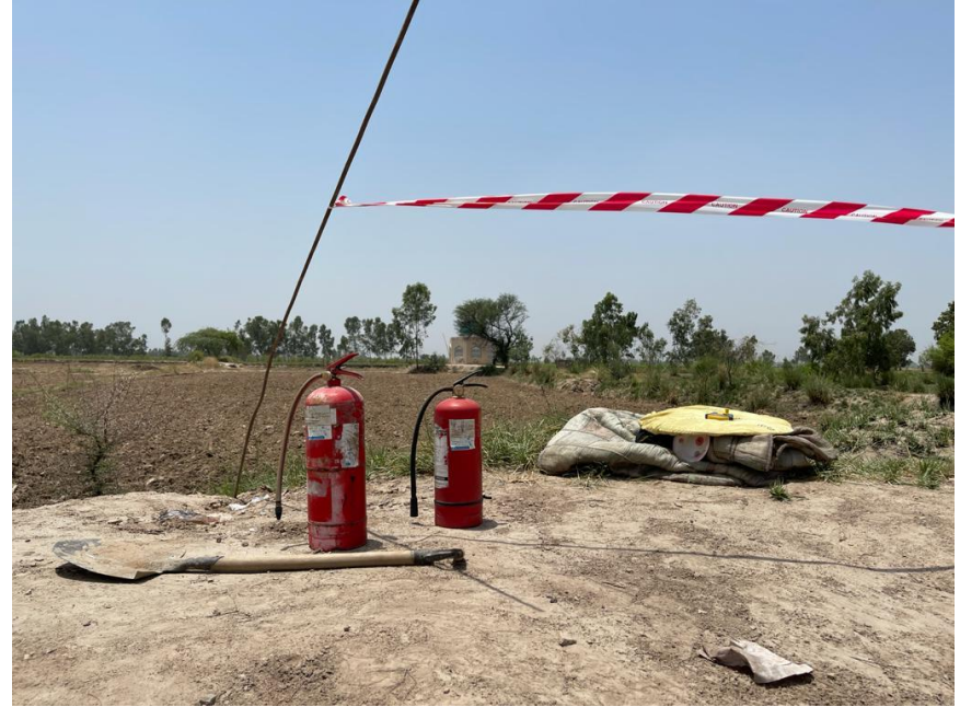
Figure 13 Fire Extinguisher Placed at Sub-project Sites