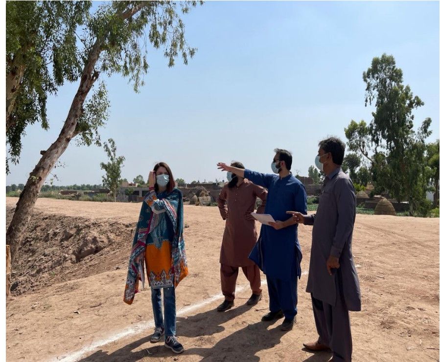
Figure 3: Consultation with Project Team at Jalala Flood Protection Bund Site