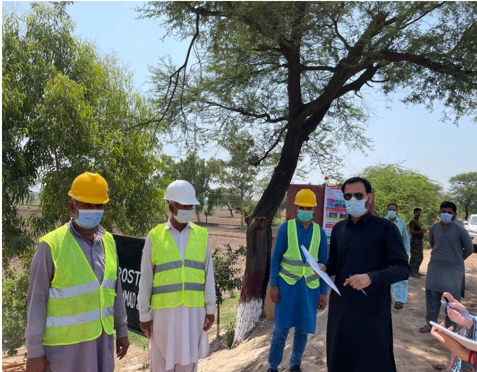
Figure 2: Consultation with Project Team at Jalala Flood Protection Bund Site