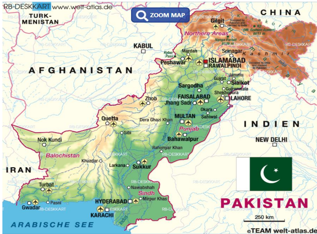
Figure 2: Map of Pakistan