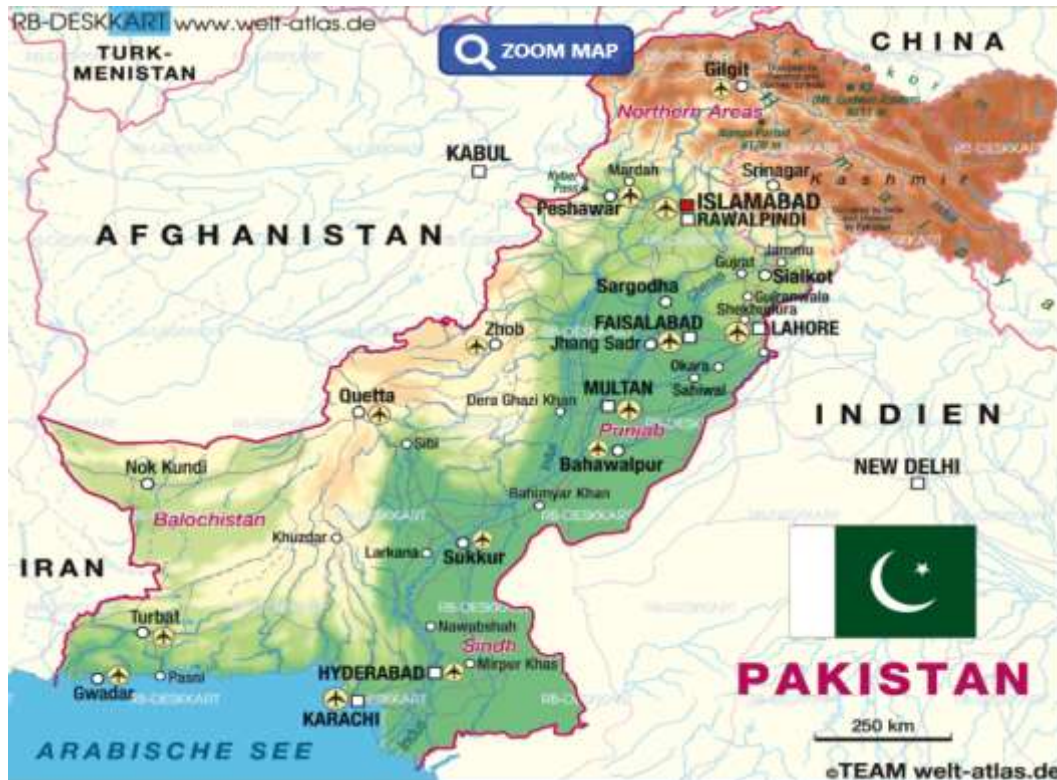
Figure 2: Map of Pakistan